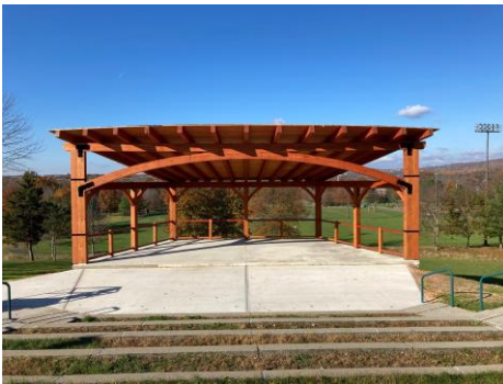
Montville Community Park Amphitheater